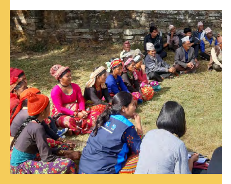
Community members participating in a focus group discussion during the joint storytelling mission in Province 7 in 2019.

Its empowering potential is strong and so is its power to facilitate norm change. The conversion of story narratives into quantitative data will allow