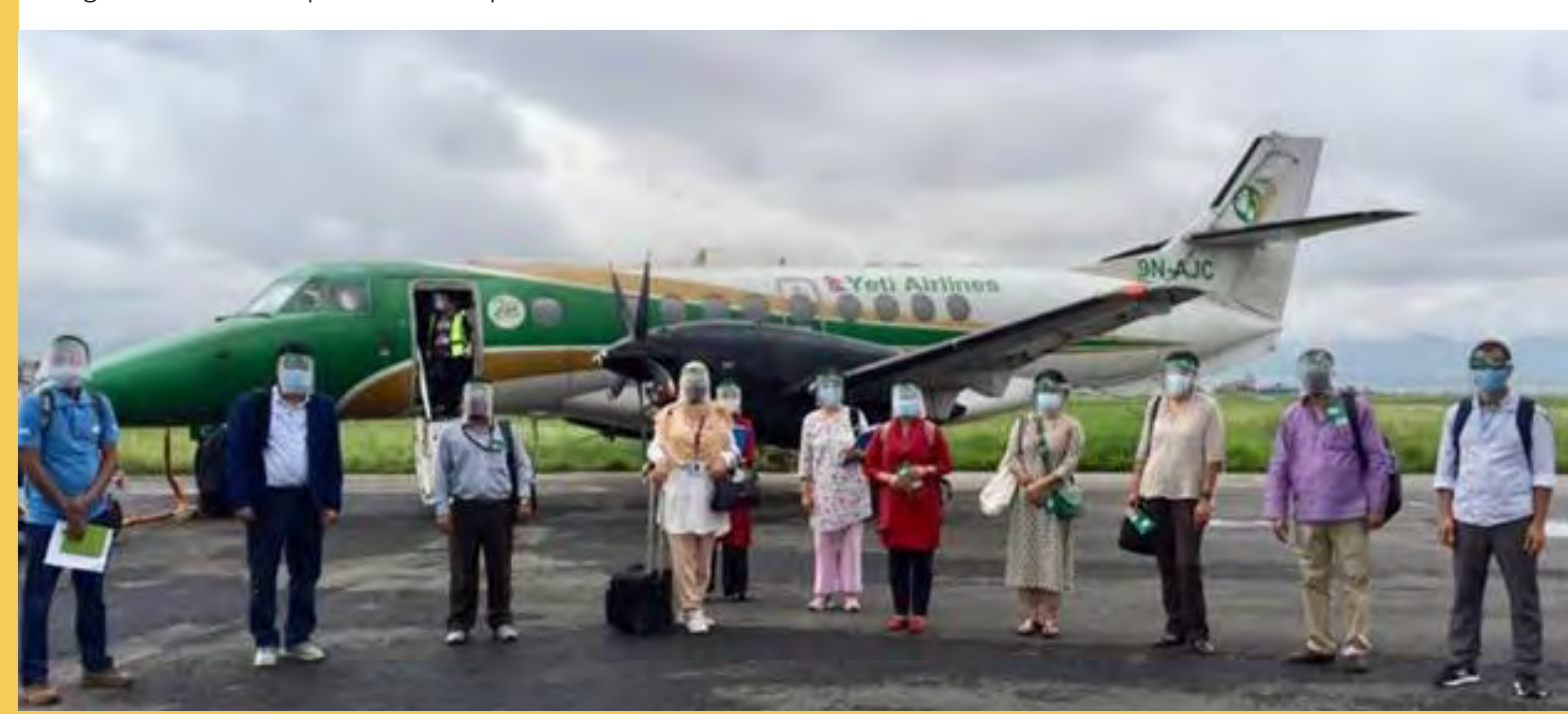
UN Team before boarding the flight for a mission to Province 2 in July 2020.

UN Women also developed and published nine Gender Equality Updates on the UN Nepal and UN Women's Regional Office for Asia and the Pacific (ROAP) websites, highlighting the emerging issues raised by women and excluded groups in the GiHA - TT meetings and the actions expected from duty bearers to ensure that Nepal's response and recovery interventions are inclusive and gender responsive.