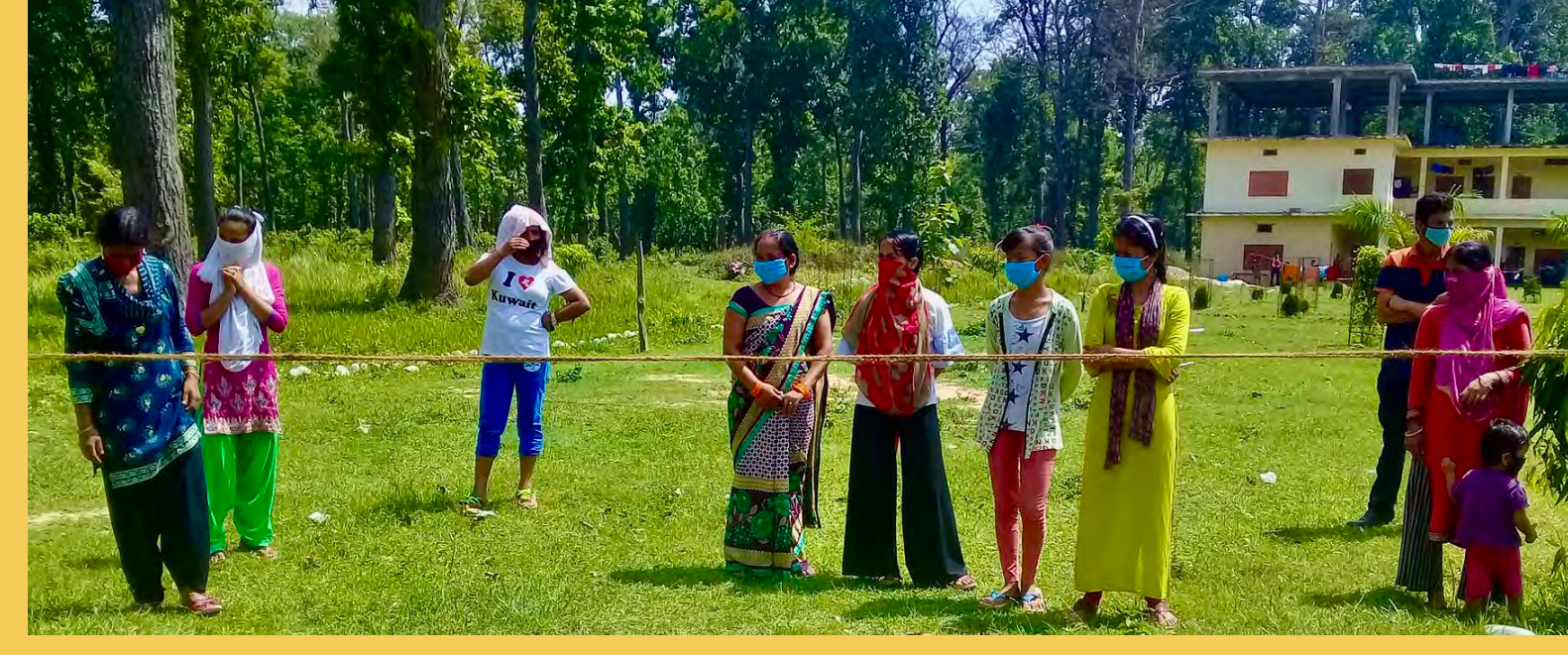
A quarantine assessment being conducted by women from marginalized groups in Kailali, Province 7 in June 2020.