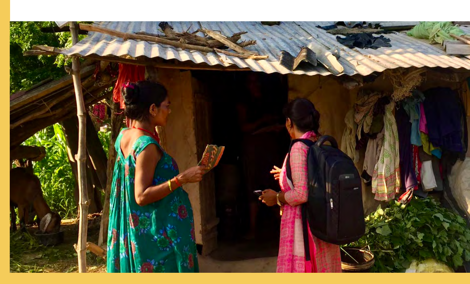
UN Women partnered with Women's Rehabilitation Centre (WOREC) to provide cash-based support to around 600 female-headed households in three districts of Provinces 2 and 7 in June 2020.

A total of 600 women heads of households from Provinces 2 and 7 received cash support from UN Women in coordination with the World Food