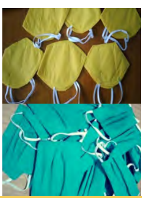
Varieties of masks prepared by Parbati during COVID-19, Kailali district, June 2020.