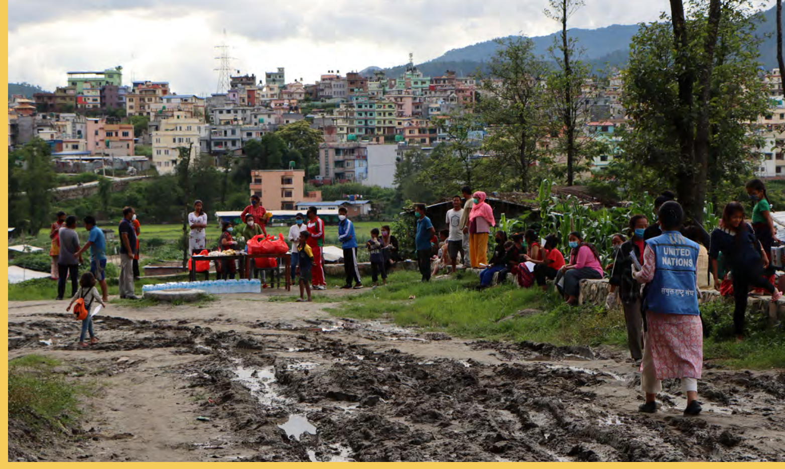
UN joint mission to Province 3 for the assessment of quarantine sites in May 2020.