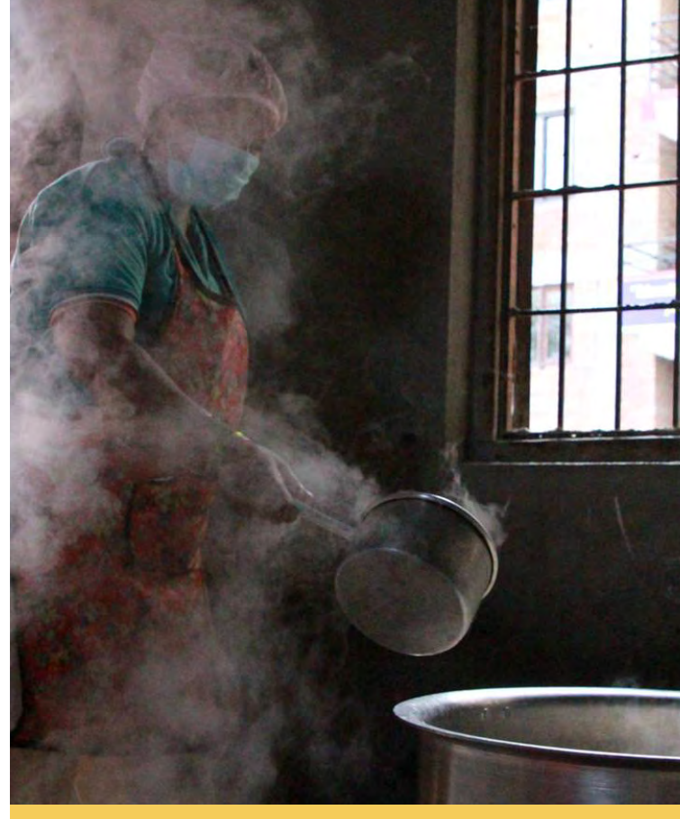
Through six community kitchens, 84,597 meals were served to communities of Provinces 3, 5 and 7 in May 2020.

During the pandemic, 350 home-based workers were supported in producing and distributing protective supplies, such as soaps, sanitizers and face masks. To expand the market for the products, UN Women linked the women with demands from UN agencies, a result of which was a bulk order of 40,000 facemasks from the UNDP. New income-earning opportunities were also created for women who were engaged in running six community kitchens in three provinces. Over 75 women are now using digital marketing through a mobile app Mero Pasal (my shop) to directly sell their products. UN Women and its partner, SABAH Nepal, provided women entrepreneurs with business development and start-up support by accessing e-commerce platforms.