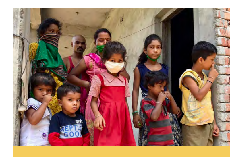
Due to increased food insecurity, UN Women's targeted interventions focused on providing relief packages in June 2020.

Increasing incidents of maternal deaths, precipitated by lack of, or delayed access to services, rising care burden for women and girls, and swelling statistics on gender-based violence (GBV), including violence against LGBTIQ+ people, can rapidly erode